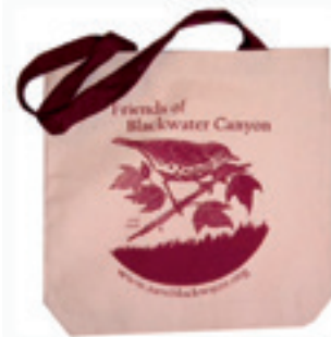
FOB Tote Bag $15.00

Books: Stories From West Virginia's Civil Rights History $12.50 Virginia Slavery and King Salt in Brooker T. Washington's Boyhood Home $8.00 An Allegheny Triumph of Justice $23.00 Tucker County History $23.00 West Virginia's Allegheny Mountains: A Photographic Journey $48.00