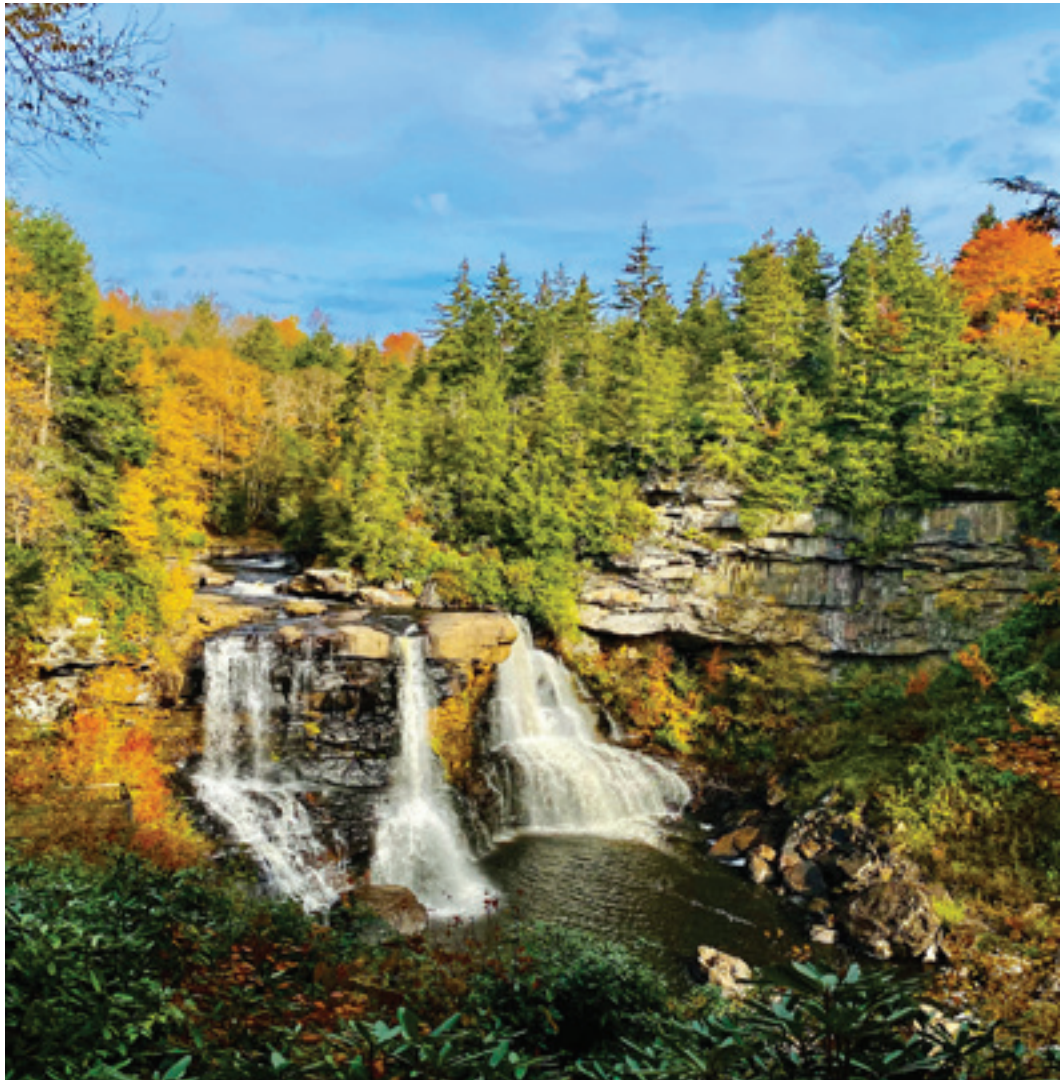
Blackwater Falls