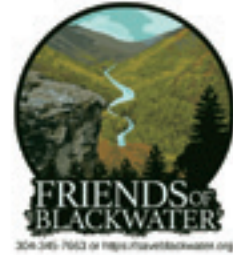
FOB Sticker $1.50