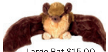
Large Bat $15.00 Small Bat $12.00