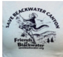
Save Blackwater Canyon Shirt Small-2XL $25.00