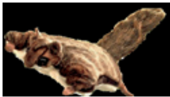
Flying Squirrel Puppet $20.00