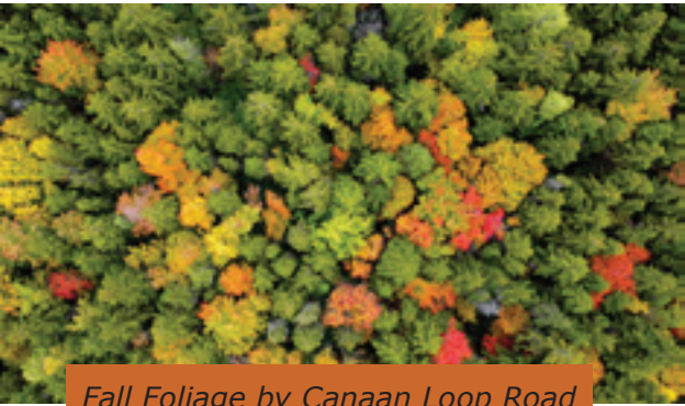
Fall Foliage by Canaan Loop Road

P.O. BOX 247 - THOMAS, WV 26292 saveblackwater.org