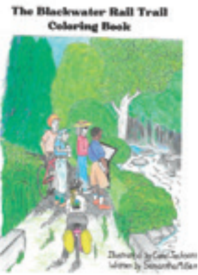
Blackwater Rail Trail Coloring Book- $7.00