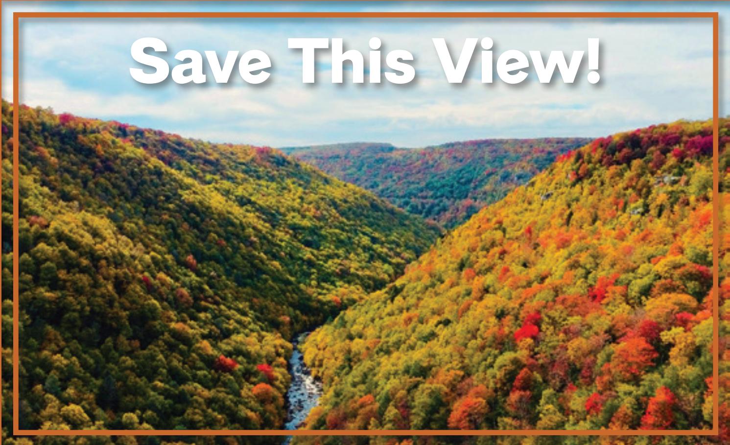
Blackwater Canyon by Frank Gebhard